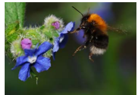
Visiting Alkanet flowers. Showing unique colour pattern