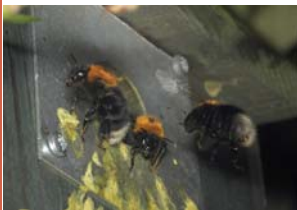
B. hypnorum nest in a bird box