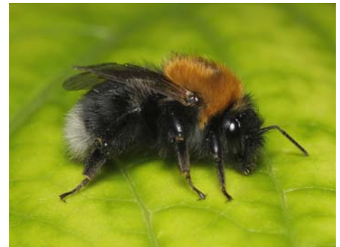
A queen of Bombus hypnorum at rest on a leaf

No special conservation measures are necessary.